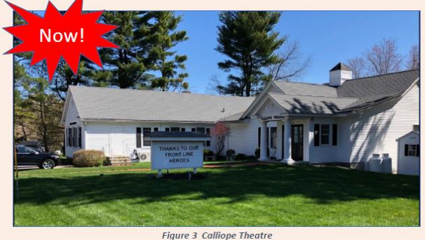
Figure 3 Callope Ineatre 150 Main Street, Boylston, Massachusetts

We offer our gratitude and congratulations to Calliope staff and performers as they celebrate 40 years of theatrical productions with an expanded repertoire of 8 shows in 2022.