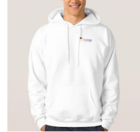
Calliope Unisex Hoodie