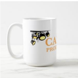
Calliope Productions 15oz Mug