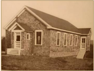
Figure 1 Our Lady of the Assumption Chapel

The Roman Catholic mission chapel of Our Lady of the Assumption known as St. Mary's celebrated its first mass on September 6, 1926. The chapel served the community for 26 years.