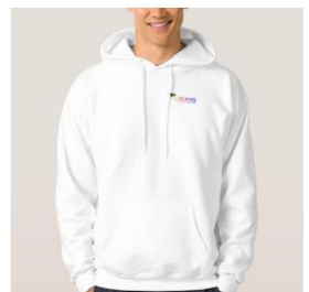
Calliope Unisex Hoodie