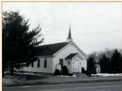
Figure 2 St. Mary of the Hills Chapel