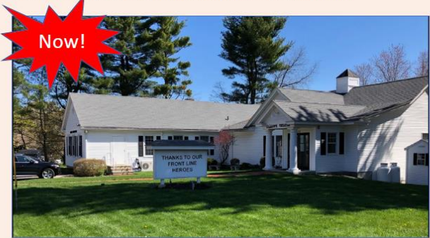
Figure 3 Calliope Theatre 150 Main Street, Boylston, Massachusetts

We offer our gratitude and congratulations to Calliope staff and performers as they celebrate 40 years of theatrical productions with an expanded repertoire of 8 shows in 2022.