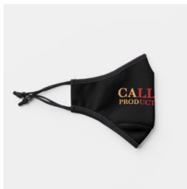
Calliope Productions Face Mask