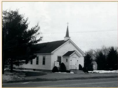
Figure 2 St. Mary of the Hills Chapel