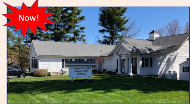
Figure 3 Calliope Theatre 150 Main Street, Boylston, Massachusetts

We offer our gratitude and congratulations to Calliope staff and performers as they celebrate 40 years of theatrical productions with an expanded repertoire of 8 shows in 2022.